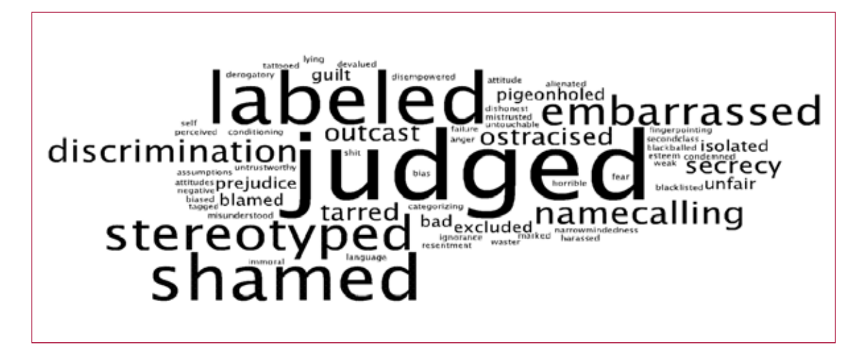
Figure 1: Graphical representation of the words used by focus group participants when asked what stigma meant to them

The negative attitudes that drug users experience and the impacts they have on them and their families are demonstrated by the way in which the people in our research focus groups responded when asked what stigma meant to them.<sup>2</sup>