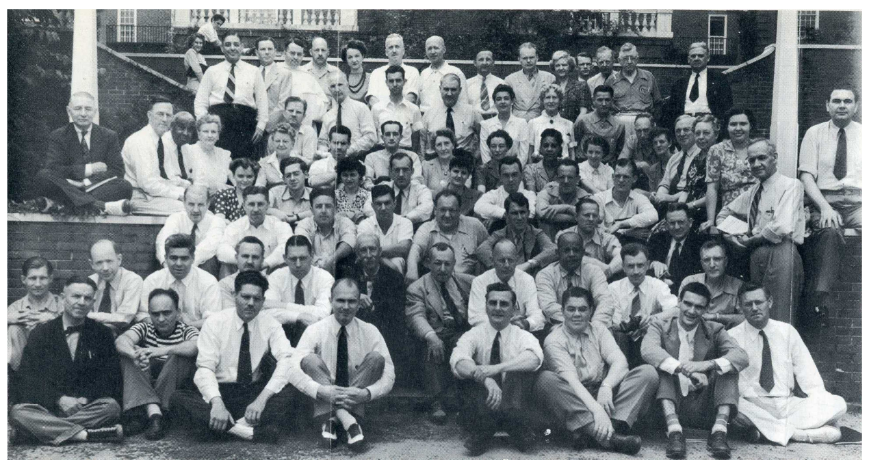
Participants at the first Summer School of Alcohol Studies at Yale in 1943

This paper presents a brief history of the first Summer School of Alcohol Studies (est. 1943) at Yale. It highlights changes in the School over time as well as significant factors (e.g., curriculum, faculty, format, interactions), and points out how these elements contributed to the School's success at Rutgers. Major issues in the field and their impact on the Schools and other programs conducted by the Center's Education and Training Division are also discussed.