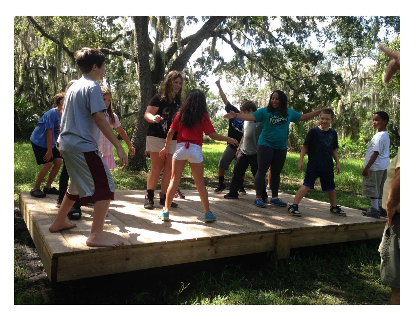
Many Camp Mariposa locations offer challenge course activities to create opportunities for confidence-building and peer-bonding.