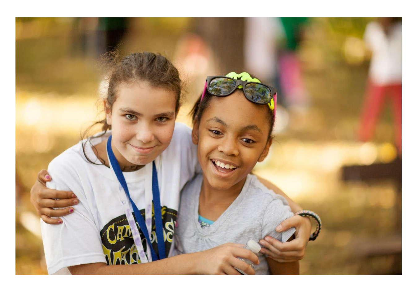
Peer-bonding and reducing feelings of isolation, fear, guilt, and loneliness are very important elements of the camp weekend.