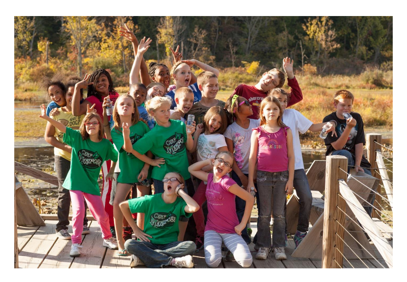
Camp Mariposa creates a fun, safe environment for campers to talk about the addiction in their family without fear of being judged. (Photo courtesy OMG Photography)

One recent quote from a camper was "Camp Mariposa helped me by doing mindfulness which helps me take in my surroundings." (Photo courtesy OMG Photography)